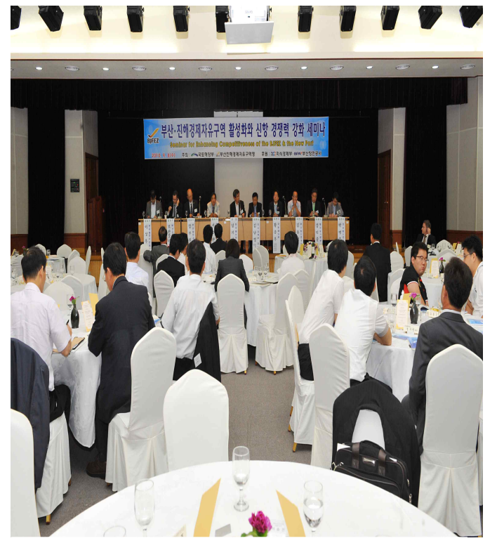
Panelists discuss issues regarding logistics

September 8 <sup>th</sup>, 2010- The Busan-Jinhae Free Economic Zone along with the Ministry of Land, Transportation and Maritime Affairs co-hosted a seminar for